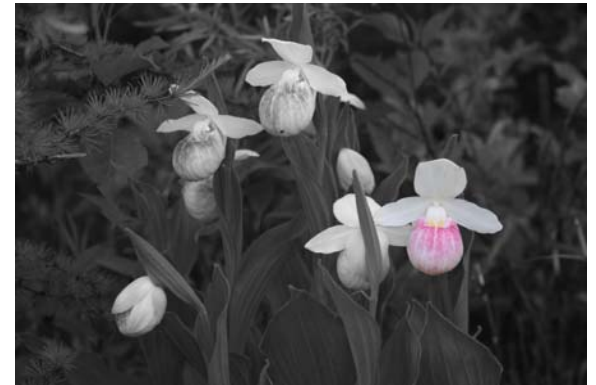
2008 Best of Show P. Bruggman