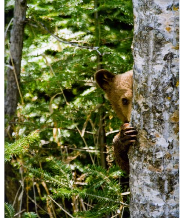
2010 Best of Show