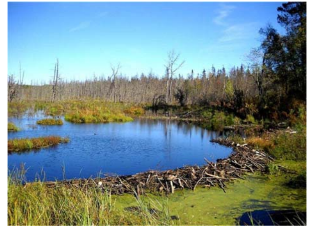
2011 Best of Show