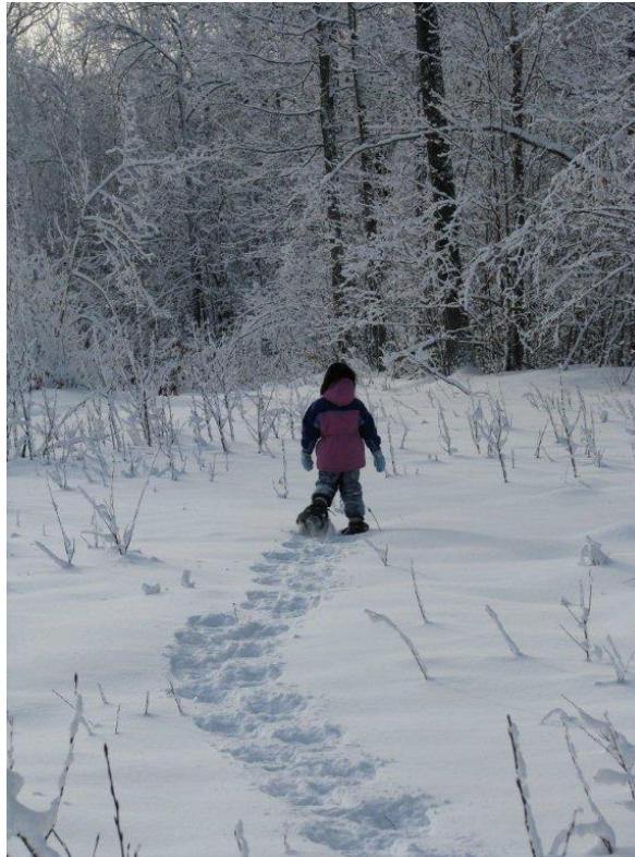
2011 Youth Best of Show C. Ford

The Friends of Rice Lake Refuge are a 501(c)3 non-profit organization