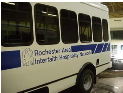
RAIHN's new 14-passenger bus is ready to roll.