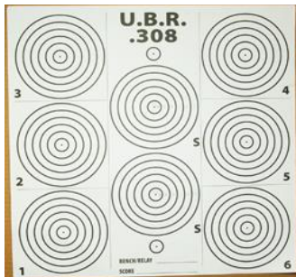
DelSavio Score Target