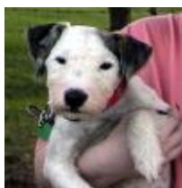
A recent rescue from the area

PVPR is currently seeking 501c(3) status as a non-profit tax exempt corporation