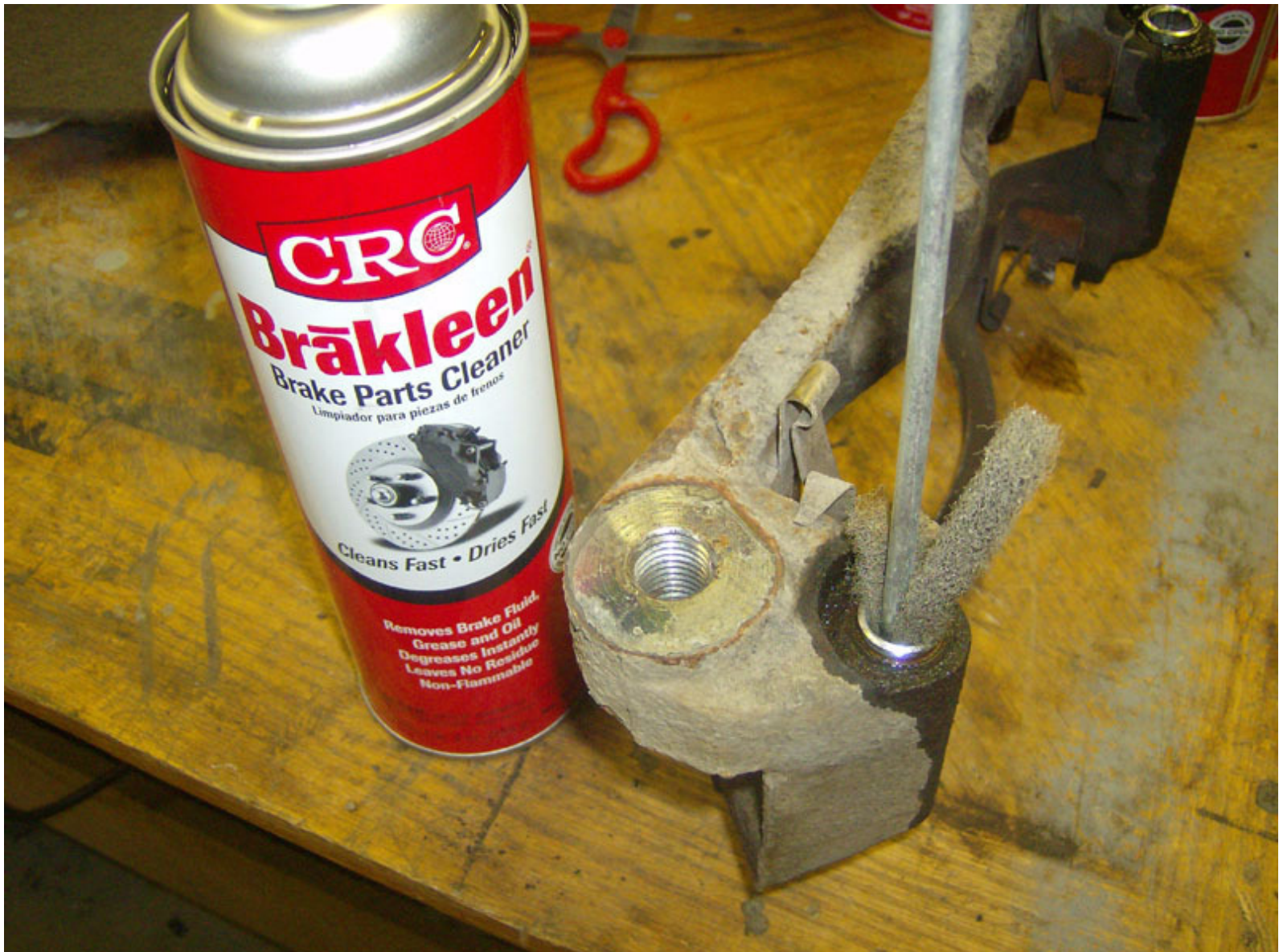
Here's the new slide pin kit, part number 2C3Z-2C150-AA.