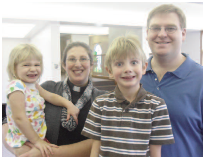
The Forsythe Family