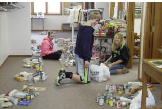
Saved By Grace, Called To Serve

Immanuel is in charge of packing and delivering the Project Hope Food Backpacks during the month of November. We will be packing Wednesday, October 30, and Wednesday, November 13, starting at 6 p.m. Light supper served for all our volunteers. Please come and support our ACGC students who may not have enough to eat at home!