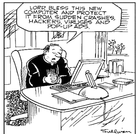
from The Joyful Noiseletter Reprinted with permission