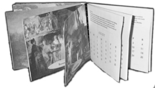
Student Project: calendar

The programs in the Department of Art lead to either the Bachelor of Fine Arts (B.F.A.) degree in a selected concentration area or the Bachelor of Arts in Secondary Education, with a concentration in Art Education (BA) degree. A two-year associates degree is also offered in Visual Communications, with options in studio arts, photography or graphic design.