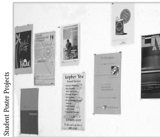
Student Poster Projects

The classroom environment consists of lecture and demonstrations, hands on development, presentation and critique. Projects range from business cards and books at the freshman level to exhibit, logo or multimedia design for seniors.